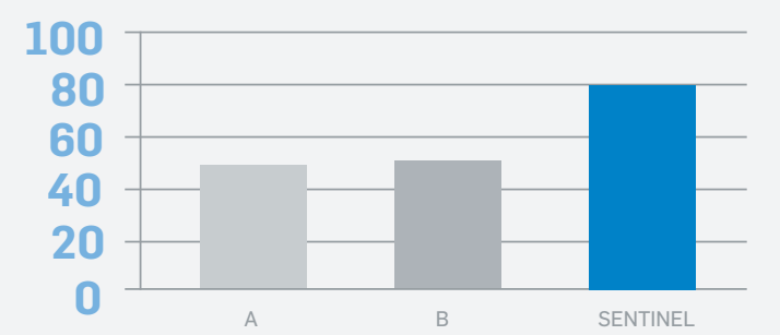
TEAR RESISTANCE - 45 lbf, minimum per ASTM D4434

SENTINEL's superior tear resistance makes it ideal for roofs designed for mechanical attachment, while also providing enhanced dimensional stability for adhered systems.